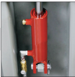
Fully hydraulic yieldable lip cylinder.