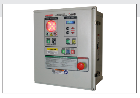
Upgrade to iDock® Controls with optional integrated equipment for a more efficient loading dock.