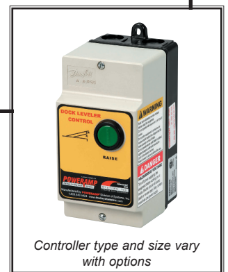
Controller type and size vary with options