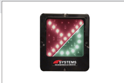
Exterior lights are standard with LED for extended life. One light shows a red X and a green circle for color-impaired individuals.