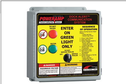
Dock Alert Communication System control panel for automatic lights - manual light control panel similar.