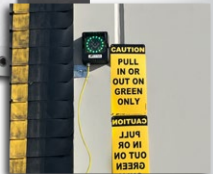
* iDock Alert controls shown with optional dock light button.