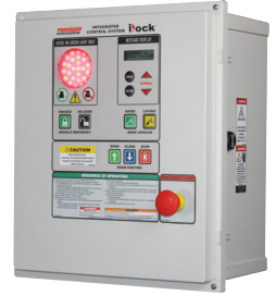
Integrated Control Panel Shown (Size varies with options)

WARRANTY: All PowerHook vehicle restraints feature a full two (2) year base warranty on all structural, hydraulic and electrical parts, including freight and labor charges in accordance with Systems, LLC's Standard Warranty Policy. Structural and hydraulic components carry an additional full three (3) year extended warranty with parts and labor. Systems, LLC warrants all components to be free of defects in materials and workmanship, under normal use, during the warranty period. This base warranty period begins upon the completion of installation or the sixtieth (60th) day after shipment, whichever is earlier.