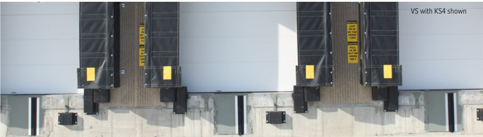
VS with KS4 shown

The POWERHOOK® KS6 free-standing frame type vehicle restraint is fully installed and integrated into full height leveler stand. It's easy to install...just weld it into position and run power to it.