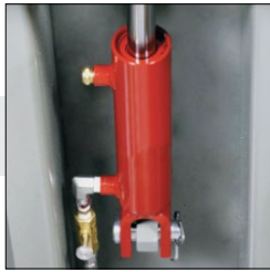
Fully hydraulic yieldable lip cylinder.