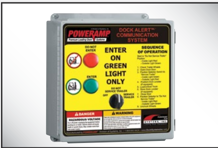
Dock Alert Communication System Control panel for automatic lights - manual light control panel similar.