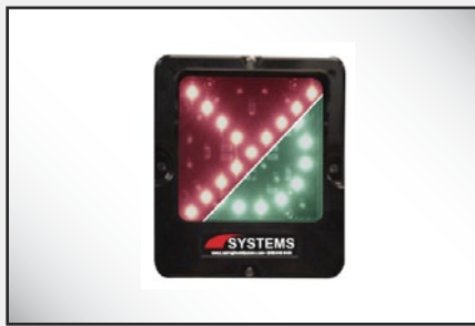
Exterior lights are standard with LED for extended life. One light shows a red X and a green circle for color-impaired individuals.