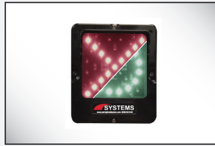
Exterior lights are standard with LED for extended life. One light shows a red X and a green circle for color-impaired individuals.