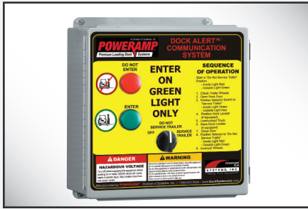
Dock Alert Communication System Control panel for automatic lights - manual light control panel similar.