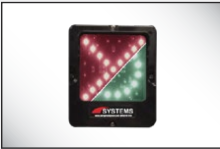
Exterior lights are standard with LED for extended life. One light shows a red X and a green circle for color-impaired individuals.