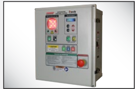
Upgrade to iDock® Controls with optional integrated equipment for a more efficient loading dock.

The iDock Alert Light Communication System is an enhanced version of Poweramp’s simple Dock Alert and provides a reliable warning system that establishes a clear line of communication between truck drivers and dock personnel, thereby reducing the risk of accidents at the loading dock.