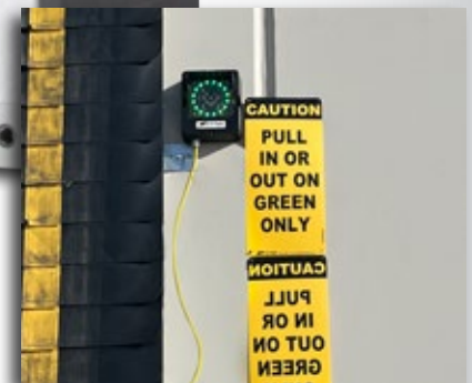
* iDock Alert controls shown with optional dock light button.