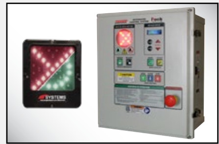
iDock® Controls includes light communication and can be integrated with other dock equipment.