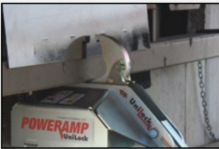
Locking mechanism maintains engagement even on intermodal trailers or an obstructed Rear Impact Guard (RIG).