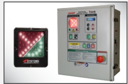
Includes light communication and can be integrated with other dock equipment in one controller.