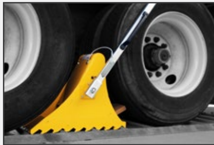
The chock system is installed with an articulated arm and ground plate to lock the chock in position.