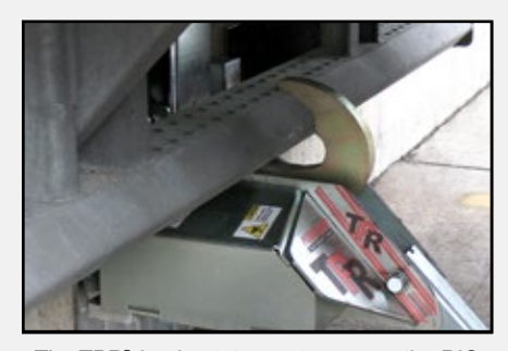
The TPR® hook rotates up to engage the RIG and secure the trailer to the loading dock.