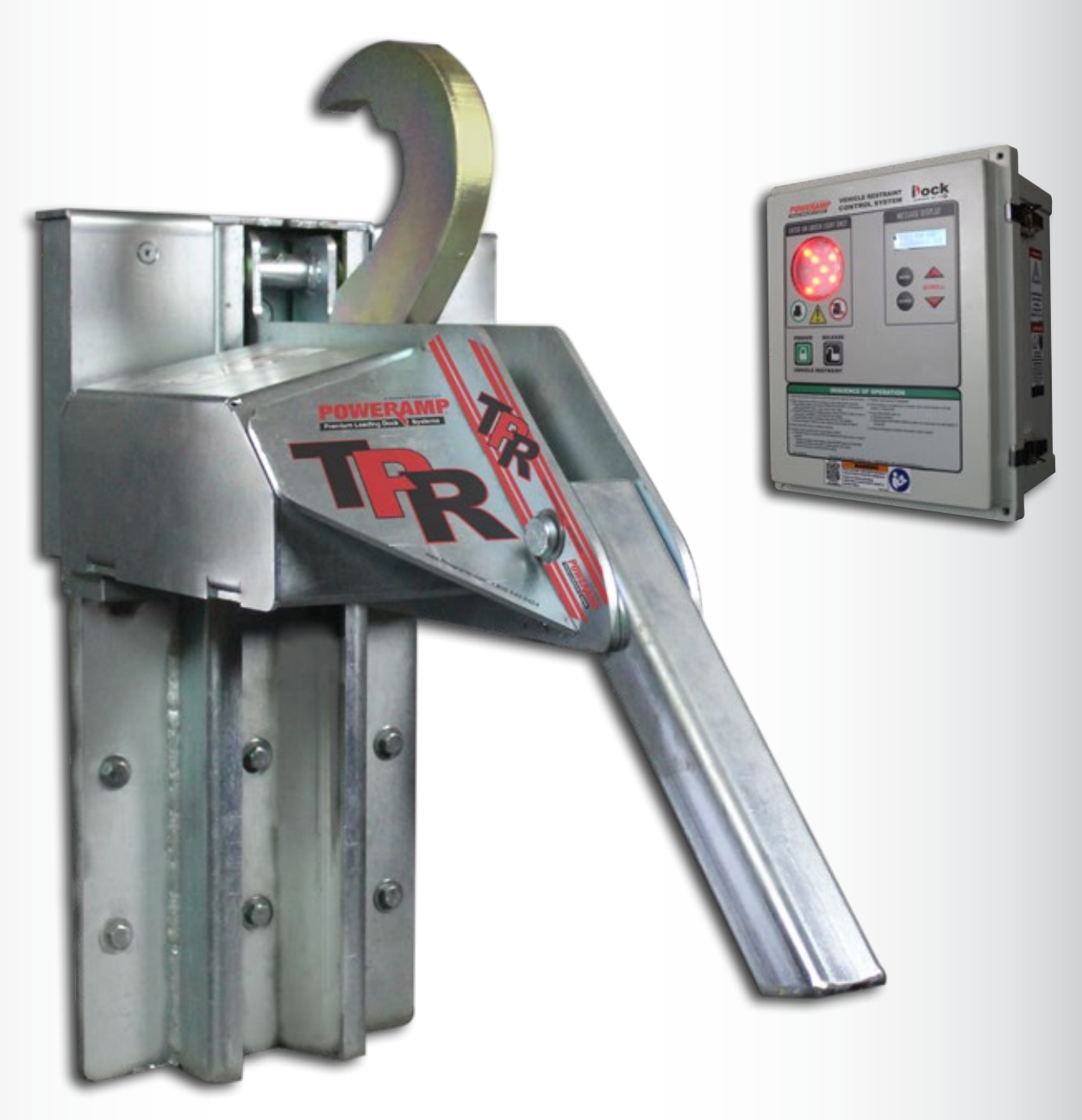
* TPR® shown with advanced communication controls.