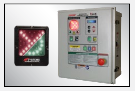
iDock® Controls includes light communication and can be integrated with other dock equipment.