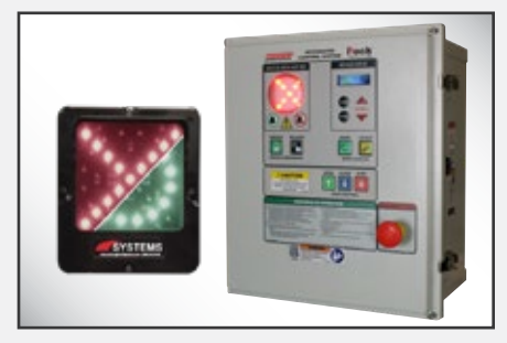
iDock<sup>®</sup> Controls includes light communication and can be integrated with other dock equipment.