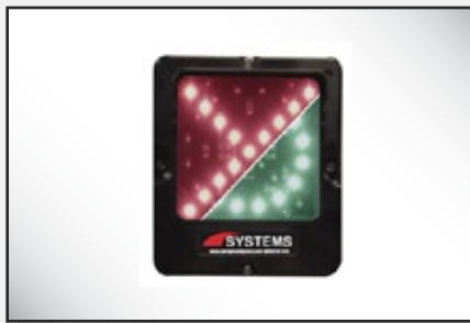
Exterior lights are standard with LED for extended life. One light shows a red X and a green circle for color-impaired individuals.