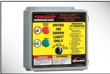
Dock Alert Communication System Control panel for automatic lights - manual light control panel similar.